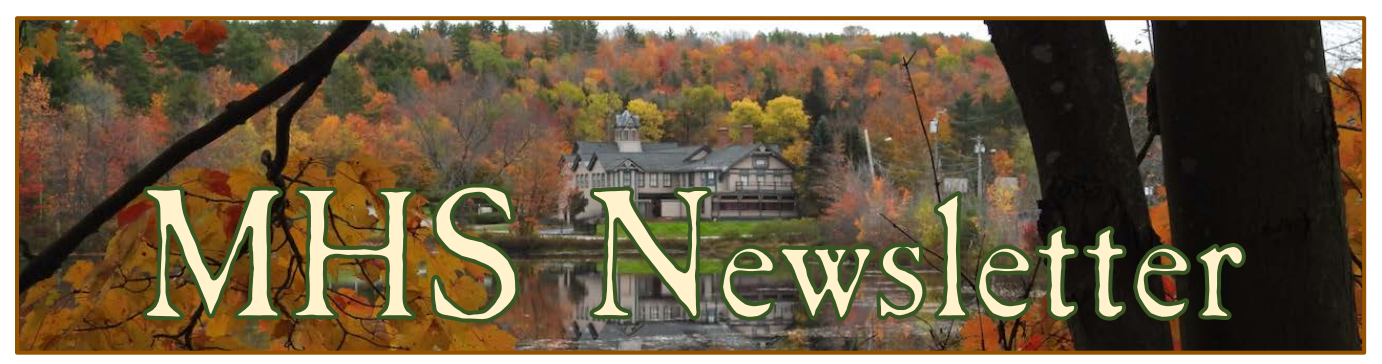
The Marlow Historical Society's mission is to preserve and illuminate Marlow's history