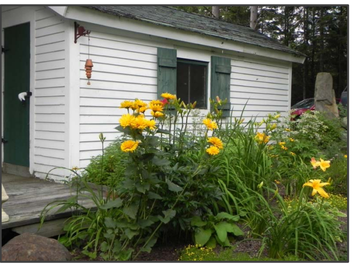
Barils' gardening shed - the little cabin where the Browns stayed when they first moved to Marlow