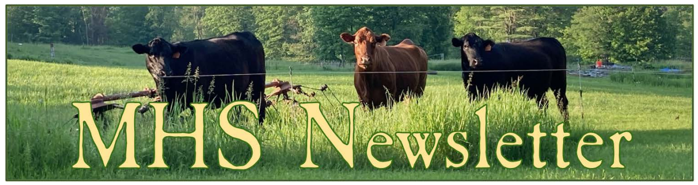
The Marlow Historical Society's mission is to preserve and illuminate Marlow's history