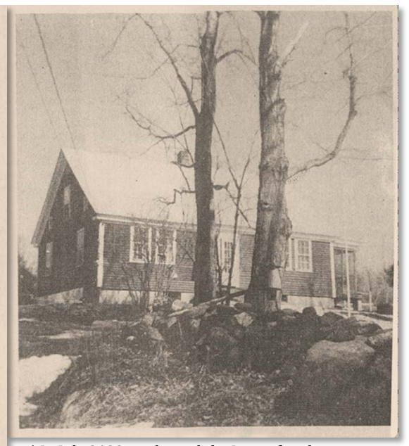
* In July 2023, we hosted the Lyons family, descendants of Abisha Tubbs, who is said to have settled on the property around 1765 and built the present dwelling. Read more in the Winter 2024 newsletter.

The house has been remodeled considerably but old features were saved whenever possible. The original center chimney and fireplaces were removed although fireplace frames remain. Old features include wainscotting, exposed beams, chimney cupboards, wall sheathing in the front entry, and old handwrought H&L hinges and latches. Several old doors retain early feather painted decoration.