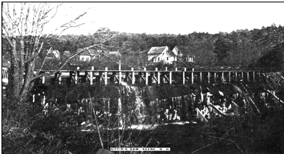
Postcard of Giffin's Dam, Keene New Hampshire. In 1901, Giffin's Mills were located on Beaver Brook.