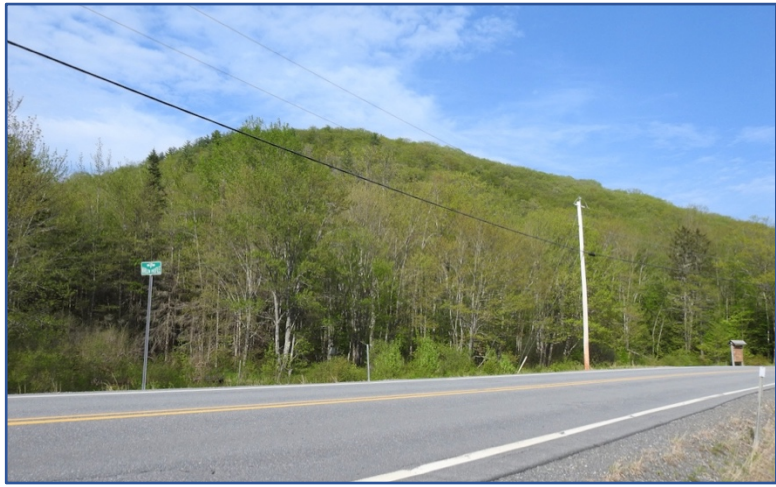
Bald Mountain from Route 123, May 2022