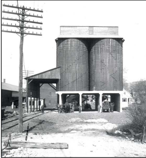
Photograph of storage silos for the Giffin Coal Company in Keene, NH